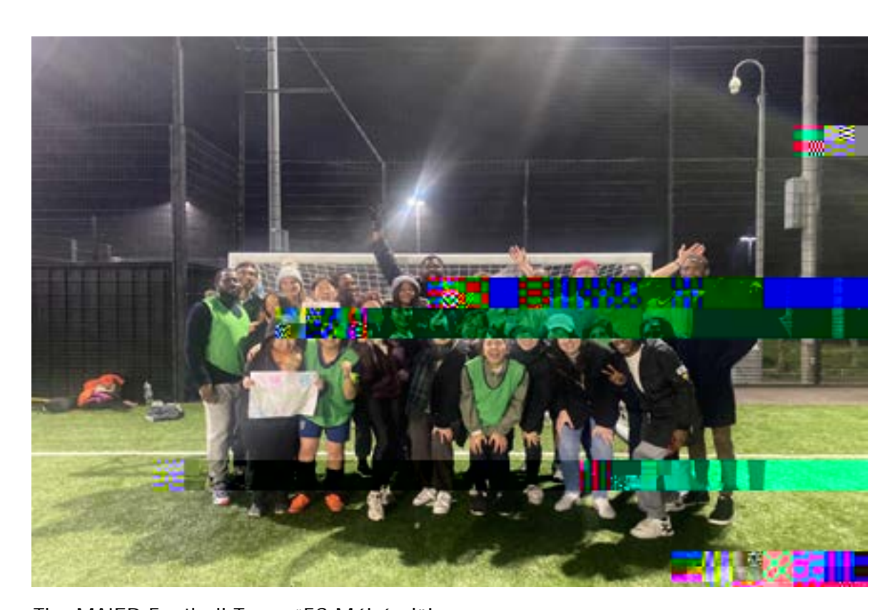
The MAIED Football Team "FC Máiréad"!